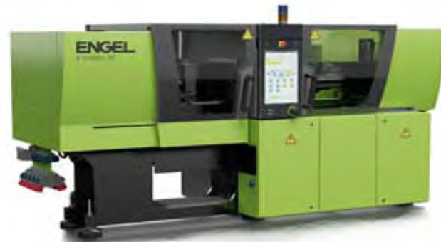
ENGEL-7 INJECTION (AUSTRIA)