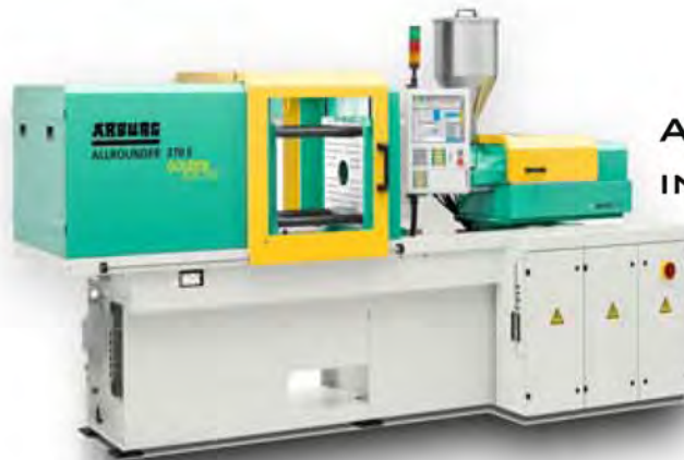
ARBURG-4 INJECTION (GERMANY)

UFB ALSO USES : MAKINO EDNC 65, HERMLE C32, MAKINO U32J, HAAS VM6.