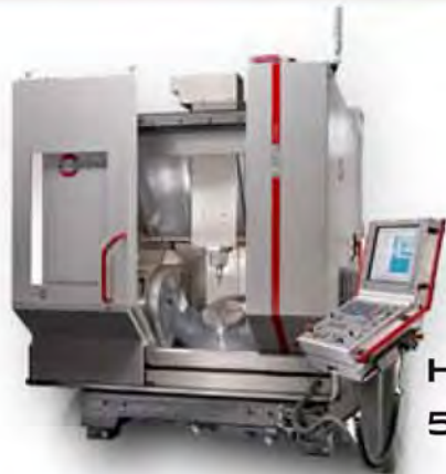
HERMLE C30U 5 AXIS (GERMANY)