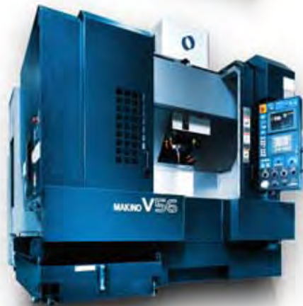
MAKINO V56 3 AXIS (JAPAN)